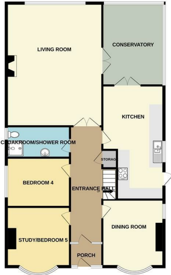
1ST FLOOR 12400 sq.ft. (1152.0 sq.m.) approx.